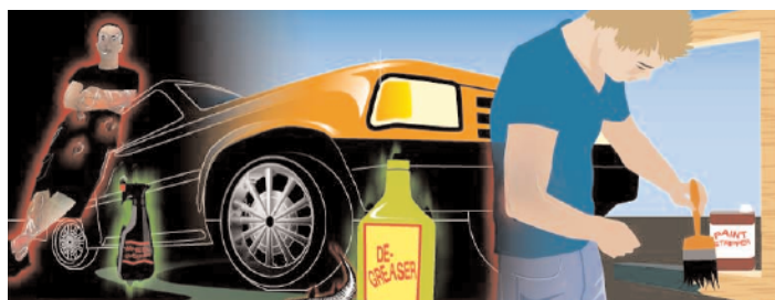
ILLUSTRATIONS BY DANNA WHITE/ACUMEN ART